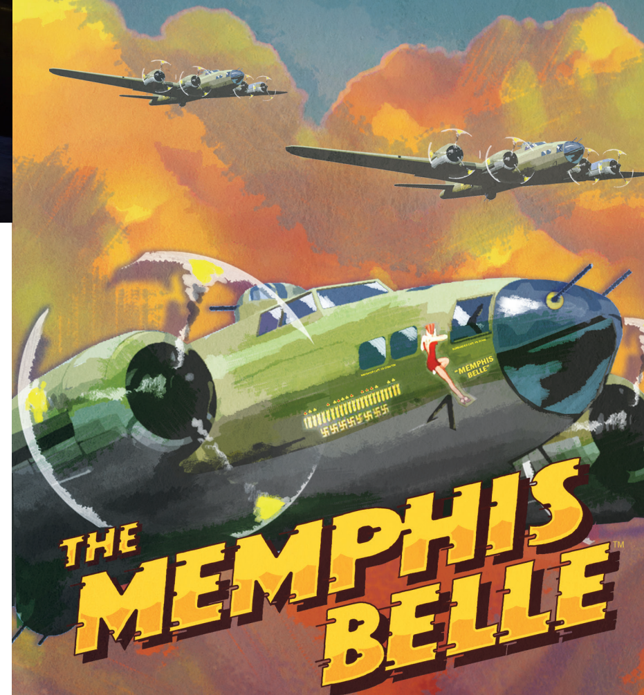
EXHIBIT OPENING & EVENTS May 17-19, 2018

NATIONAL MUSEUM OF THE UNITED STATES AIR FORCE™