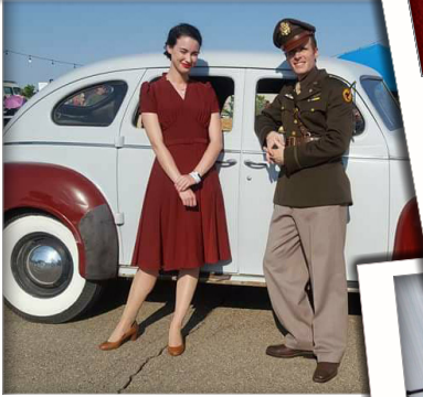
1940s era "home front" reenactors and vehicles