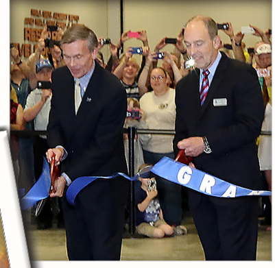
Memphis Belle Exhibit Ribbon Cutting Ceremony