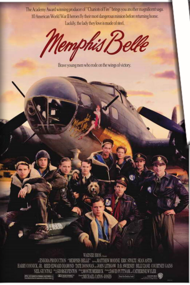
1944 & 1990 Memphis Belle movies with guest speakers

Kids can complete Ration Card Scavenger Hunts for a prize (while supplies last)