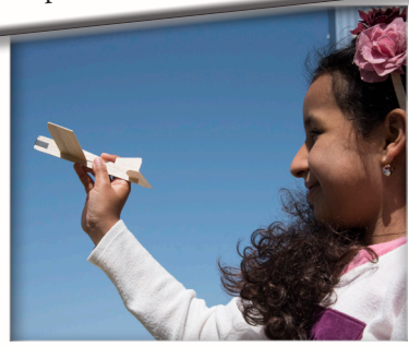
Kids can build and fly balsa wood gliders (while supplies last)