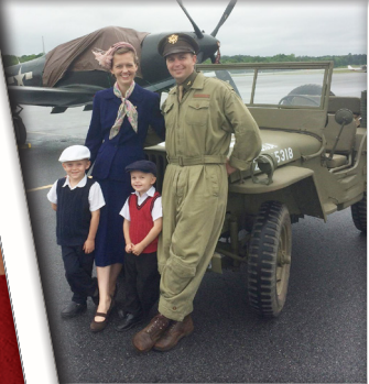
WWII military reenactors and vehicles