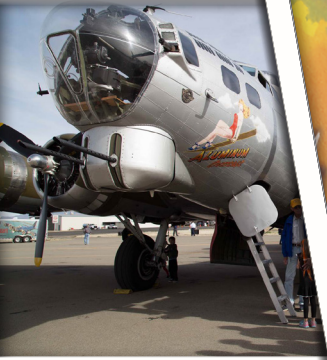
WWII aircraft on static display