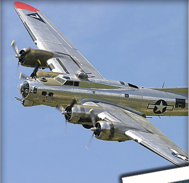
WWII aircraft flyovers