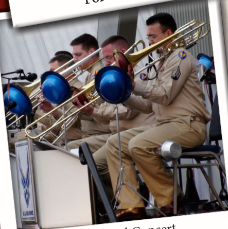
Big Band Concert performed by Air Force Bands