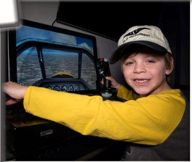
Kids can test their skills on computer flight simulators