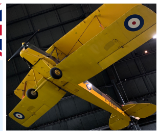
De Havilland Tiger Moth