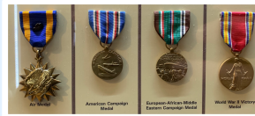
Air Medal, American Campaign Medal, EAME Campaign Medal, WWII Victory Medal

"I WILL SUMMON EVERY RESOURCE TO PREVENT THE TRIUMPH OF DEATH OVER LIFE." – The Flight Nurse Creed