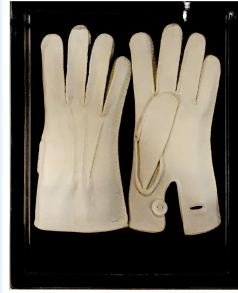
WASP FLYING GLOVES

Who was the first woman to fly a USAAF jet when at Wright Field, she flew a YP-59 twin jet fighter?