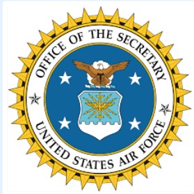
Seal of the Secretary of the Air Force

She was the first woman to serve as the highest ranking position of the Air Force.