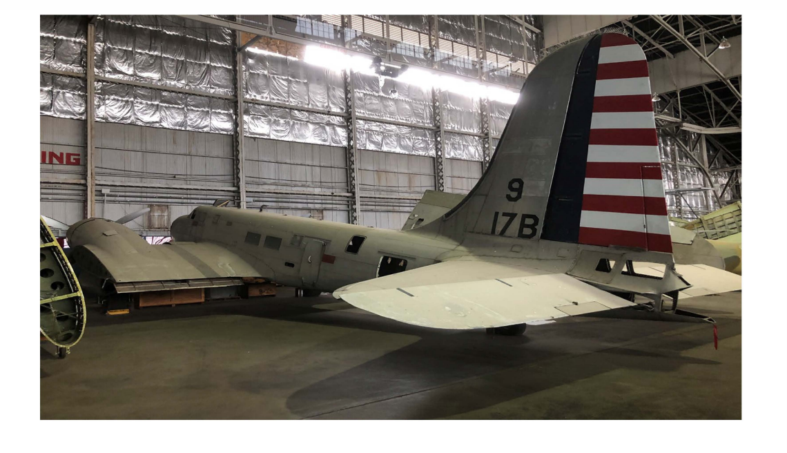
B-23, Serial Number 39-0037