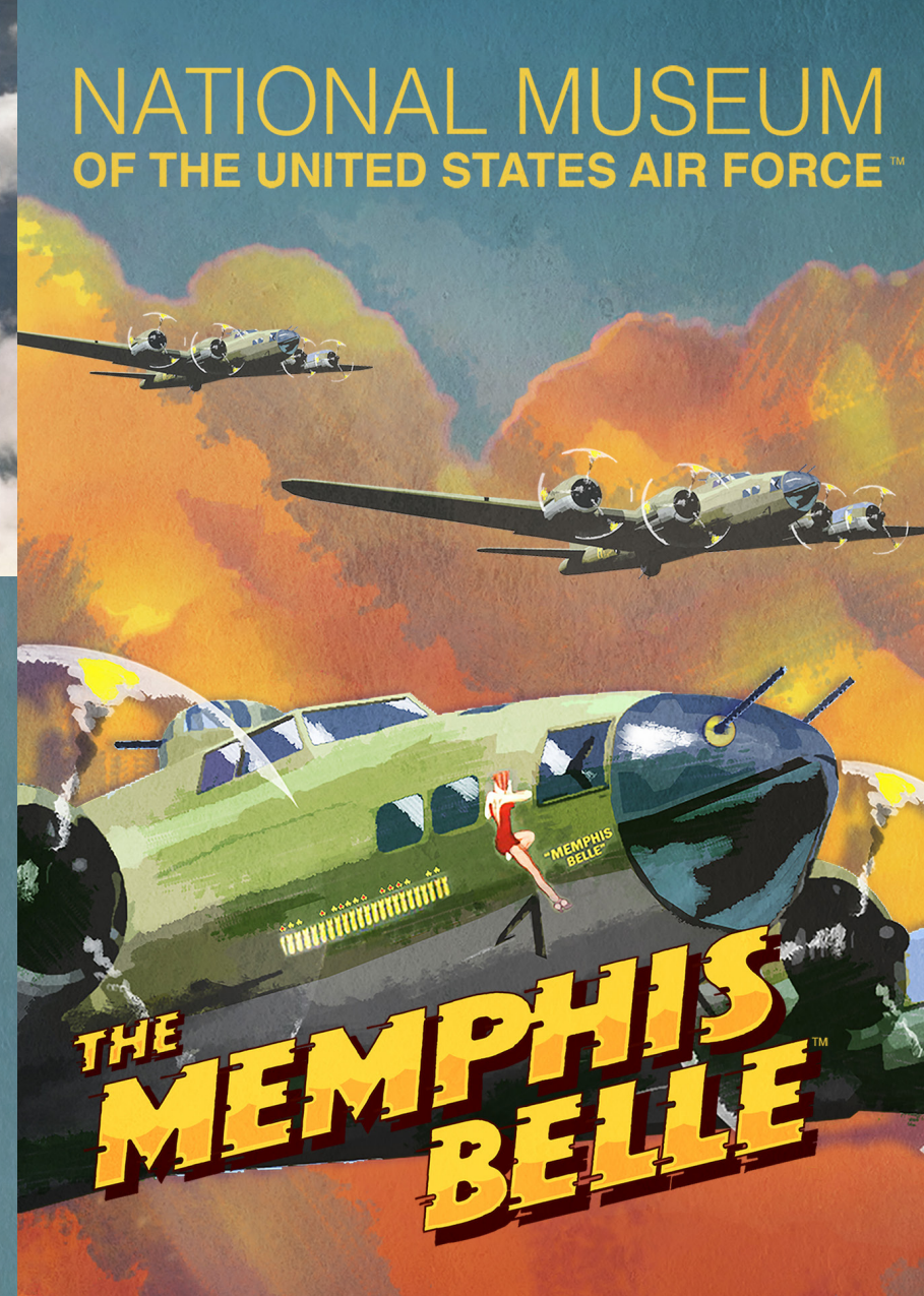
EXHIBIT OPENING & EVENTS May 17-19, 2018

For more information visit www.nationalmuseum.af.mil 1100 Spatz Street | Dayton, Ohio | 937-255-3286